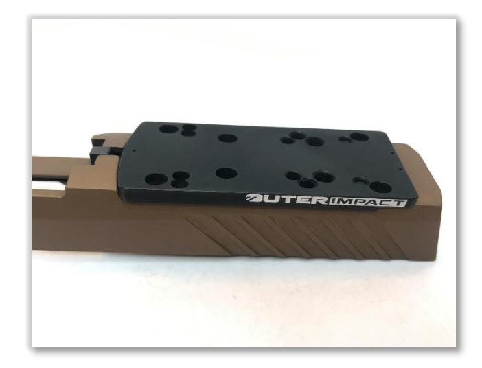
Step 4: Reassemble slide per manufacturer instructions.

Step 3: Secure adapter plate to slide using the 4-48 screws from the bag marked MNT HDWR and torque to 15 in/lb with a torque wrench.